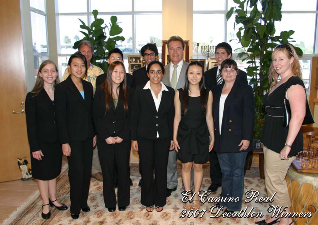
El Camino Real 2007 Decathlon Winners