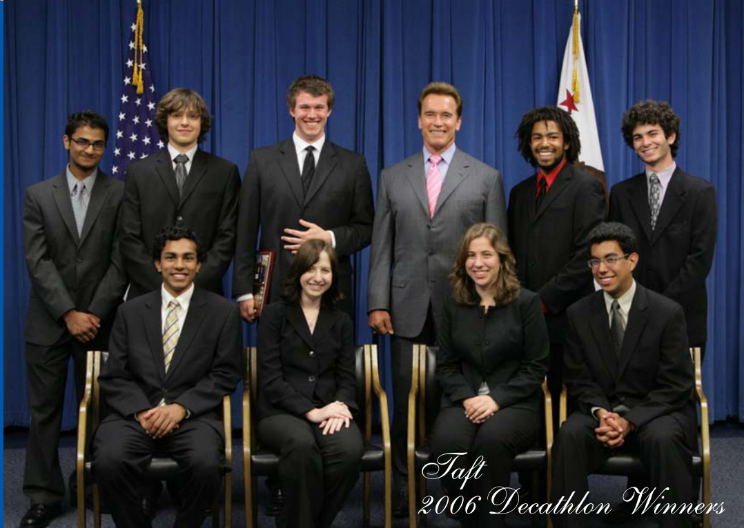
Taft 2006 Decathlon Winners