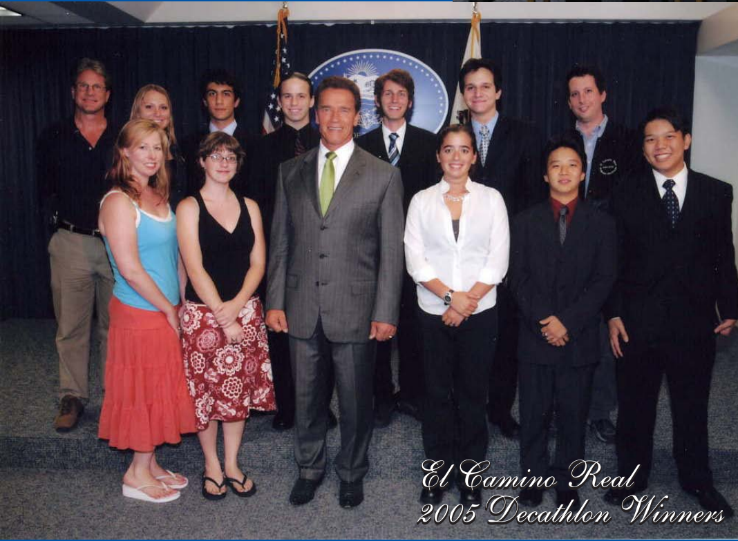
El Camino Real 2005 Decathlon Winners