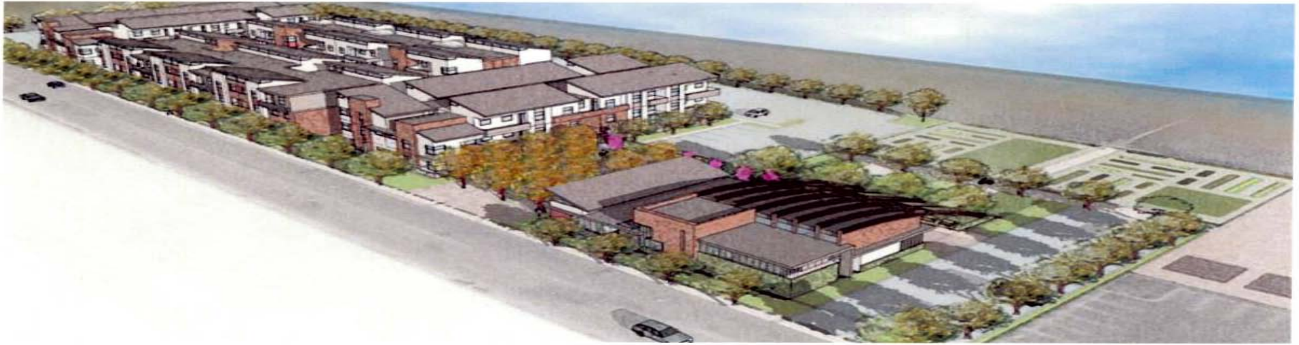
South East Bird's-eye View with Joint Use Building in Foreground