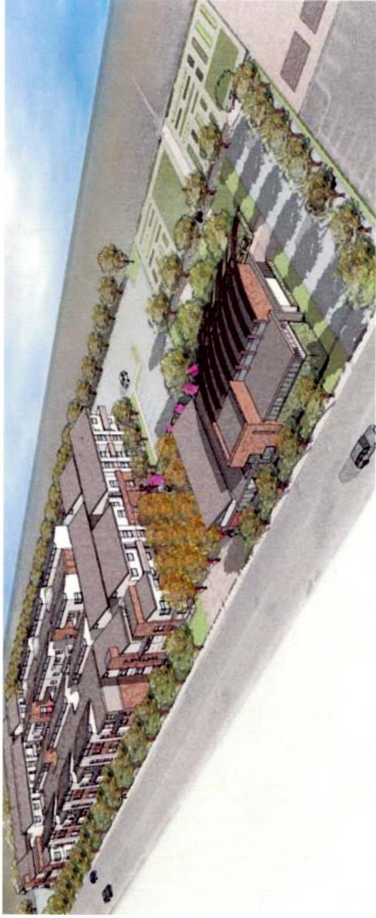
South East Bird's-eye View with Joint Use Building in Foreground

Staff Recommended Proposer: Bridge Housing